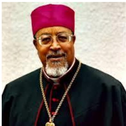
Monsignor Berhaneyesus Demerew Souraphiel, Archbishop of Addis Ababa